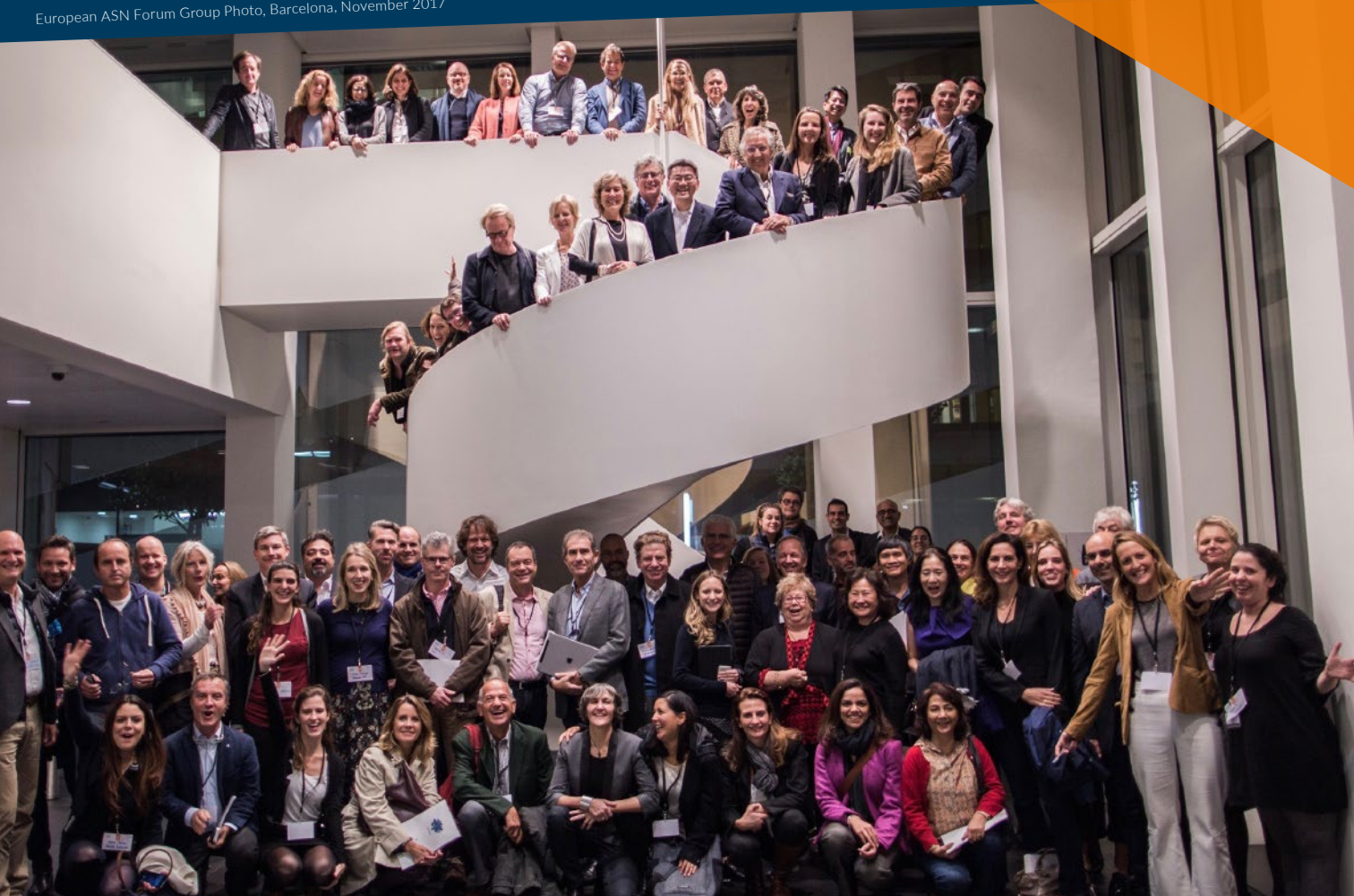
European ASN Forum Group Photo, Barcelona, November 2017