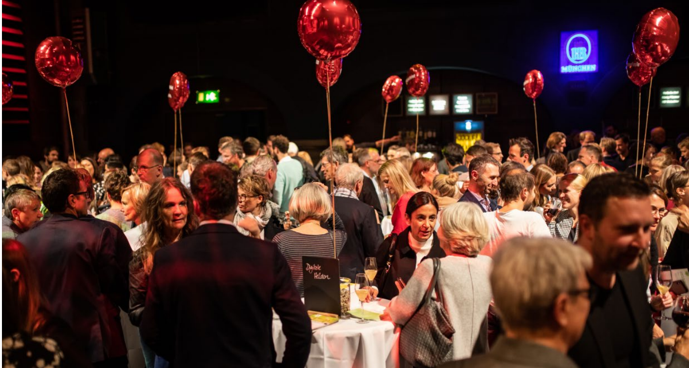
Ecosystem networking at the German Induction 2018

Ashoka was named #5 most influential NGO worldwide